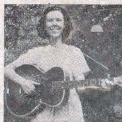
"Can't Thank Your School Enough"