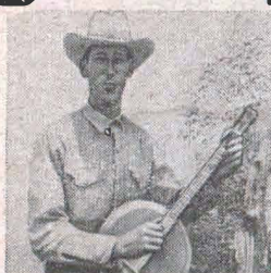
Plays Banjo in a Short Time