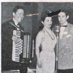
Now a Famous Orchestra Leader